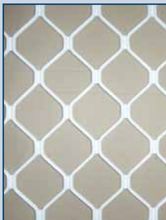
White powder coated