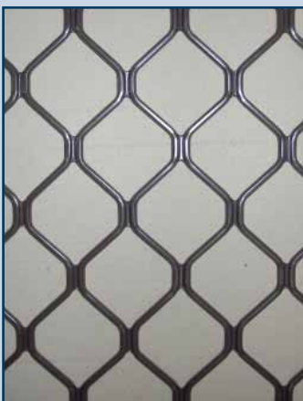
Brown powder coated